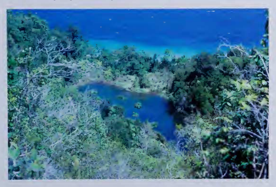
Figure 7 Lagoon, south-west corner of island.